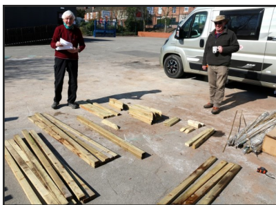
Reading the instructions

One activity we undertook as lockdown eased was the construction of an Eco-Greenhouse which had been delayed from the previous year. Unfortunately restrictions still did not allow us to involve the children, other than ask them to collect bottles. Two sunny days in the Easter holidays enabled a few members to start the build.